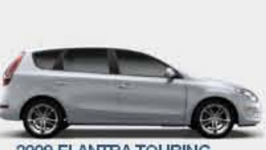
2009 ELANTRA TOURING