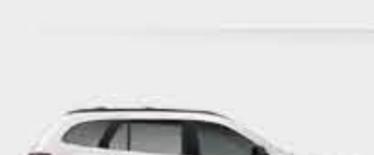
2009 SANTA FE