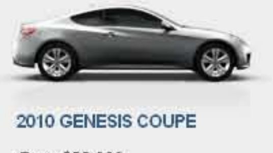
2010 GENESIS COUPE