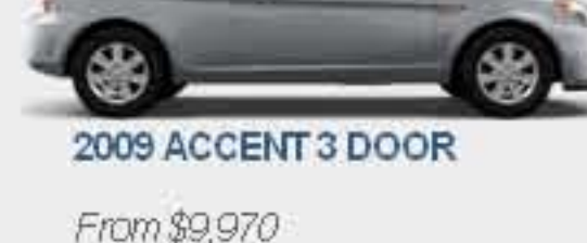
2009 ACCENT 3 DOOR