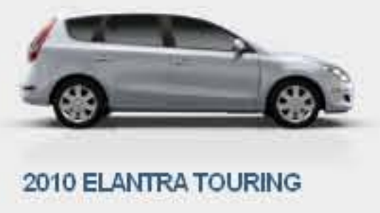
2010 ELANTRA TOURING