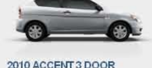
2010 ACCENT 3 DOOR