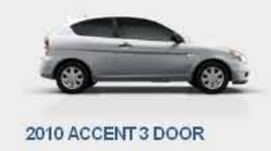
2010 ACCENT 3 DOOR