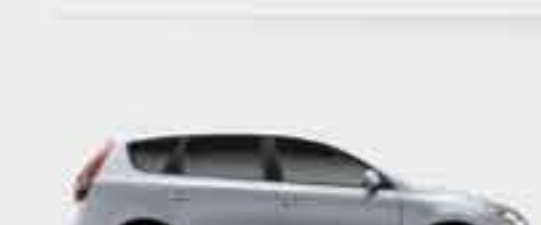
2010 ELANTRA TOURING