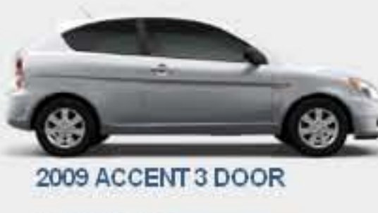
2009 ACCENT 3 DOOR