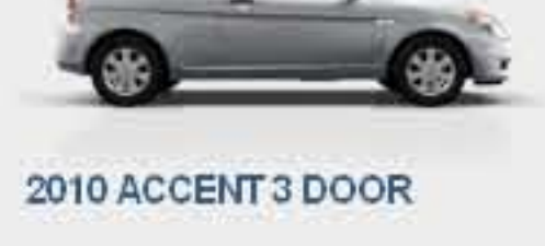
2010 ACCENT 3 DOOR