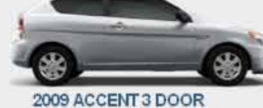
2009 ACCENT 3 DOOR