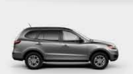
2010 SANTA FE