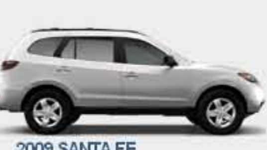
2009 SANTA FE