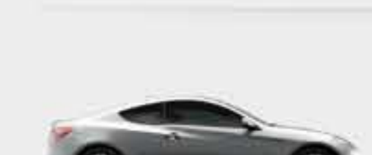
2010 GENESIS COUPE