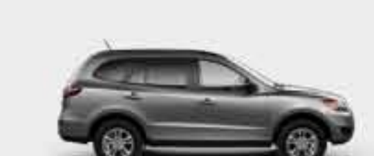
2010 SANTA FE