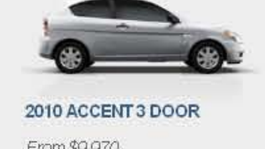
2010 ACCENT 3 DOOR