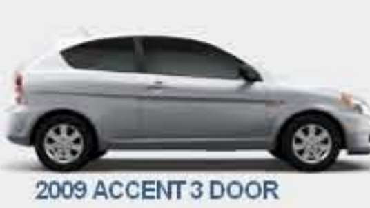
2009 ACCENT 3 DOOR